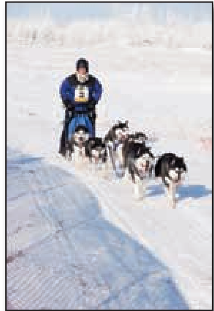
Dogsledding at the Rosebud Run!

The ALS Society of Alberta hosted a table at the Canadian Association of Gift Planners' "Leave a Legacy" Seminar at Mount Royal University. The Seminar informed audiences about wills and estate planning. The seminar had a fantastic turnout – thanks to everyone who was there!